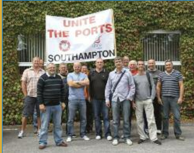
Dockers in Southampton, UK

Get involved! Send us photos of you and your colleagues and they'll be posted on the GNT website and could even appear here in the bulletin. Email your photos to: gntdockers@itf.org.uk