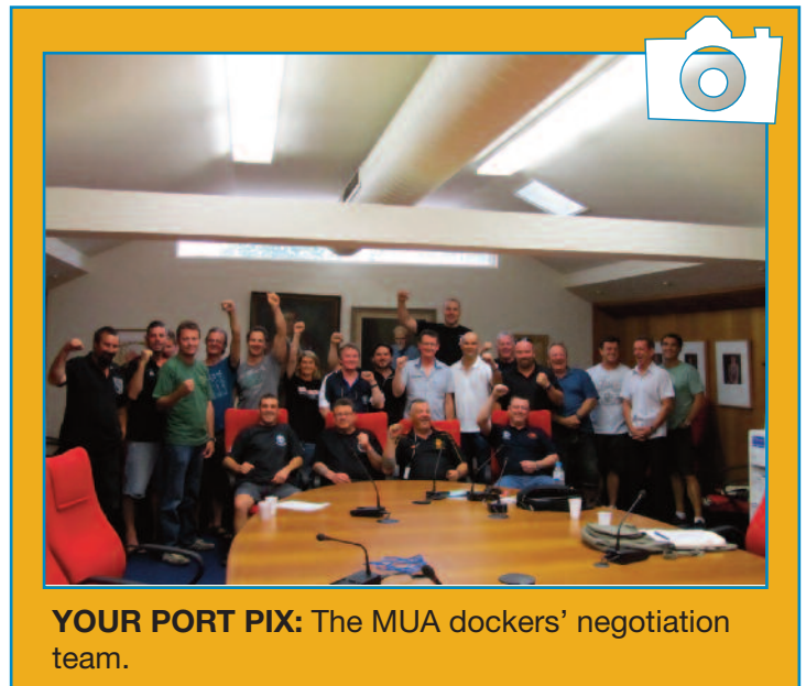
YOUR PORT PIX: The MUA dockers' negotiation team.

A Solidarity is not just a 'feel-good' statement, it is real action and real commitment from other unions, community groups and activists. One of the keys to success in campaigns is the forming and maintaining of coalitions which essentially broaden the scope of the conflict. Involving the community, environmentalists, consumers and even shareholders, can add another level of attack. They can then help the unions through boycotts, rallies and putting other forms of pressure on companies that union can't do on their own.