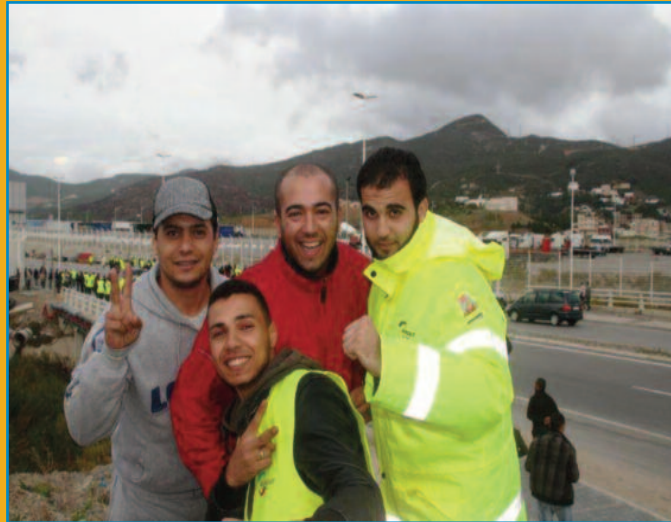
Workers at Eurogate terminal, Tangiers, Morocco

Get involved! Send us photos of you and your colleagues and they'll be posted on the GNT website and could even appear here in the bulletin. Email your photos to: gntdockers@itf.org.uk