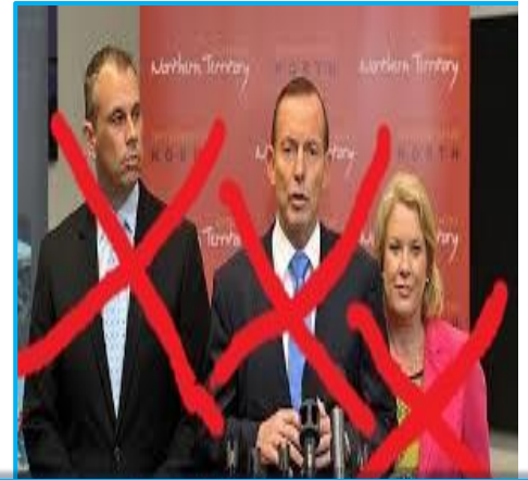
Giles, Abbott, Griggs: Attack Aussie Jobs, we will STAND UP and FIGHT BACK!!

You can contact Maritime Super at info@maritimesuper.com.au or by calling Member Services staff on 1800 757 607