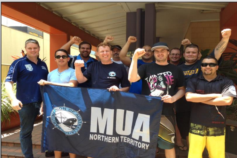
NT BRANCH NEWS – JULY 2015