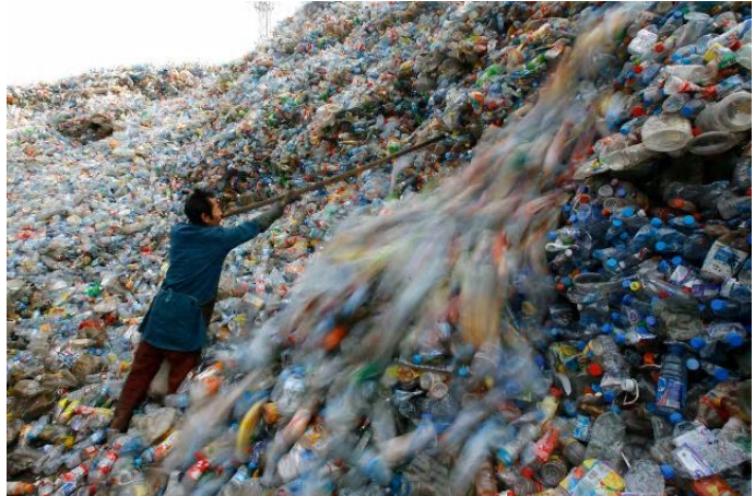
A worker sorts plastic bottles at a recycling centre on the outskirts of Wuhan, Hubei province, China.

In 2015, consumers in China purchased 68.4bn bottles of water and in 2016 this increased to 73.8bn bottles, up 5.4bn.