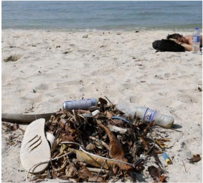
You'll find them on the beaches, too.

Fewer than half of the bottles bought in 2016 were collected for recycling and just 7% of those collected were turned into new bottles. Instead most plastic bottles produced end up in landfill or in the ocean.