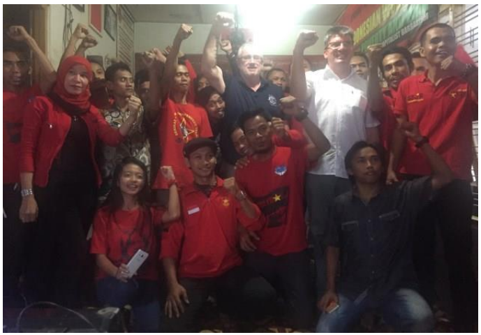
They may be poor in money terms but they are some of richest working class people I have ever met in terms of spirit and dedication