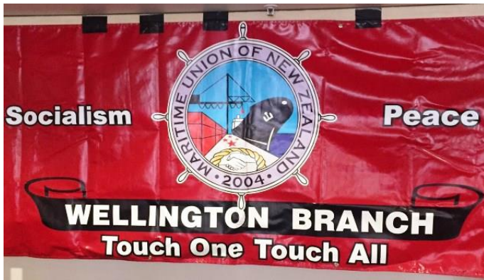
Wonderful Banner from MUNZ

It was really a terrific Conference, not showy but a down to earth Conference reflecting the reality of MUNZ. It is a down to earth fighting union.