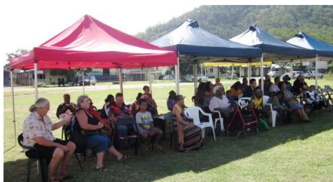
Locals and visitors on Palm Island for the commemoration

You must bear in mind it was the norm of the day that these people were not even classed as human beings and were referred as 'beings' under the Foliage & Fauna Act.