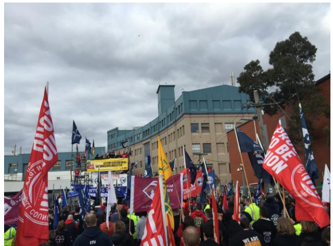
Union Members Rally at Carlton United Breweries

kicked in another $12,000 and later they had a fund raiser event with all money raised going to support the 55 sacked employees and their families. All members have vowed to maintain and continue the fight until these workers, including a number of apprentices, get their jobs back.