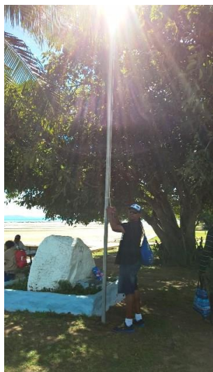
Paddy Neliman raising a flag in honour of Mr Gordon Tapau – one of the Zenadh men

In 1957, seven brave men stood together against the government official on the island and passively demanded all ill-treatment stop being implemented for all the peoples on the island.