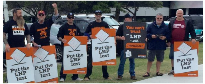
Cooly Rock Members Showing Support