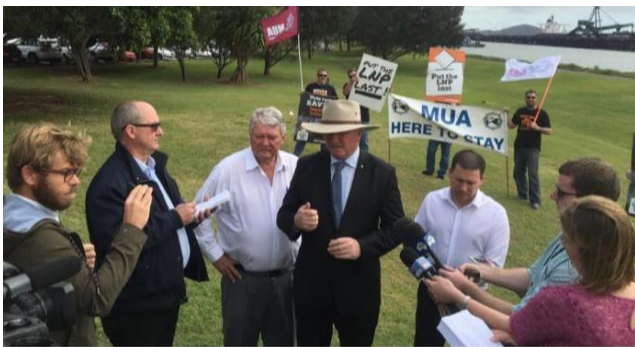
MUA Members Confront Barnaby Joyce

In a cooperative action with the MUA, ETU and AMWU we made sure the workers of Gladstone were represented at a press conference held by the Deputy Prime Minister Barnaby Joyce.