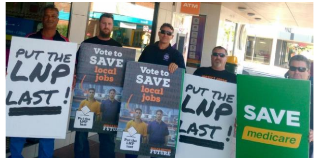
MUA Members Rallying in Gladstone

Removing highly qualified Australian seafarers from Australian waters is in stark contrast to all the LNP rhetoric about creating jobs and growth, it defies logic when it comes to border security and is an environmental disaster waiting to happen.