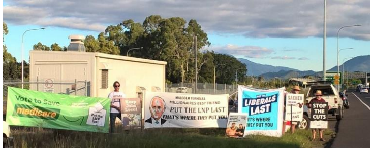
Great Election Activity from Cairns Members

MUA MEMBERS FROM Cairns have risen to the challenge and been very active during this election campaign.