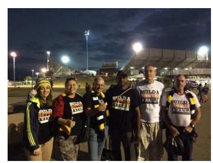
Volunteers in Townsville - Building a Better Future Awareness

Volunteers handed out Building a Better Future flyers to members of the local community coming through the turnstiles at the stadium and reminded them that the coming federal election would have a direct impact on jobs, Medicare and education.