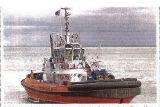
BHP has awarded the tug boat contract for its Hay Point terminal to Rivtow Marine and the MUA is fighting against the move in its leaflet, below

The way it has been explained to us is that the tugs on Dalrympie Bay have historically boosted four-strong crews. The two BMA tugs that Rivtow will operate from July will be populated by crews of three with two deckhands being replaced by one more qualified and highly paid mate. The reforming