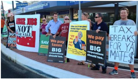
Members Rally in Far North Queensland