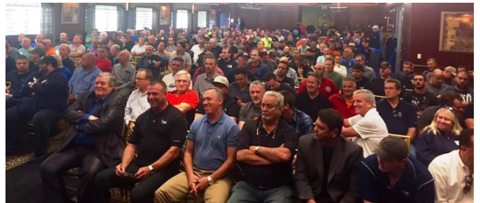
ILA Headquarters in New Jersey - USA