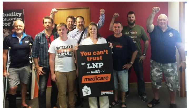
MUA Volunteering at the ACTU Phone Bank – Put the LNP Last