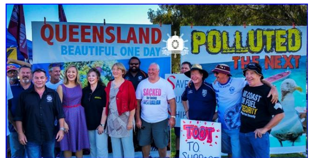
Qld Greens Senator Larissa Waters with Paul Gallagher and MUA Members at the Jobs Embassy – Canberra

Cross bench Senators and independents continue to raise issues within the House and Senate and continually engaged with us at the forecourt Embassy.