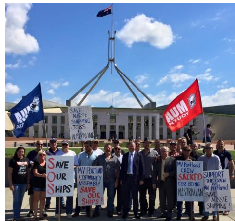
Portland Assembly MUA Officials, Members, Supportive MP's – Canberra

Wednesday February 3 2016 saw the launch of the MUA Shipping Campaign at the steps of Parliament House. Queensland Delegates were selected to attend, Assistant