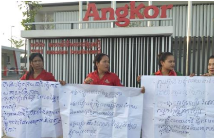
Workers dismissed for fighting for their rights

The company refused the union's request for talks on the contracts and escalated the conflict on January 15 by extending working hours to 11:00 PM, which puts the women at greater risk of harassment from customers and transport difficulties at late hours. Determined to win their rights, the women struck on January 16. Management responded by claiming that current contracts had expired and that the striking workers had to accept new short-term contracts.