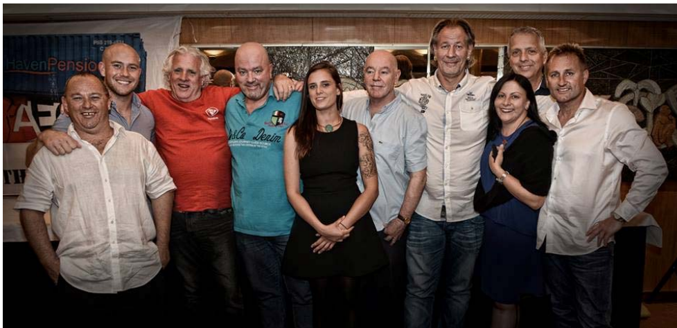
MUA and FNV (Dutch dockers) members celebrate in Rotterdam