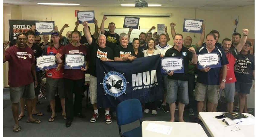
MUA Members at the North Queensland Campaigns Intensive workshop in Mackay

Wednesday December 30: 8am-12.30pm Thursday Dec. 31: 8am-12.30pm Friday January 1: Closed Monday Jan. 4: 8am-4pm (as normal)