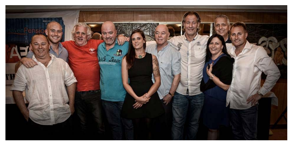
MUA and FNV (Dutch dockers) members celebrate in Rotterdam

well received by everyone at the venue, and we got a chance to tell everyone how Hutchison Ports had disgracefully sacked us by midnight text.