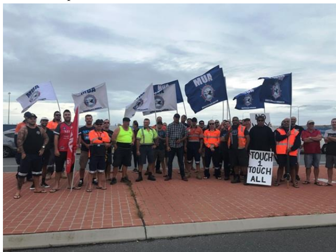
Hutchison and Patrick's wharfies standing side by side 8 February 2019

Members have been protesting at Fisherman's Island and have received terrific support particularly from our membership at Patrick's.