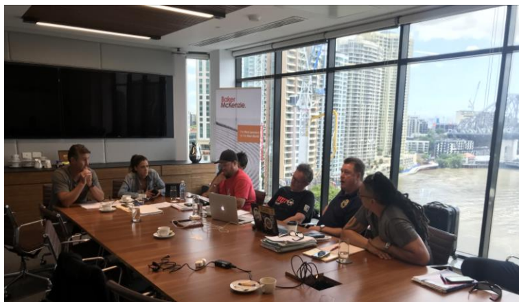
MUA Members met Wednesday 23 January 2019 in Brisbane with Hutchison management. Some definitive progress was made.