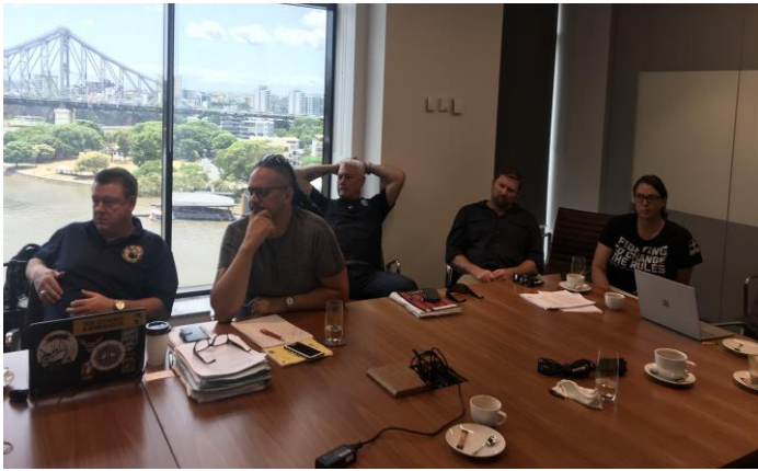
MUA Members met Wednesday 23 January 2019 in Brisbane with Hutchison management. Some definitive progress was made.