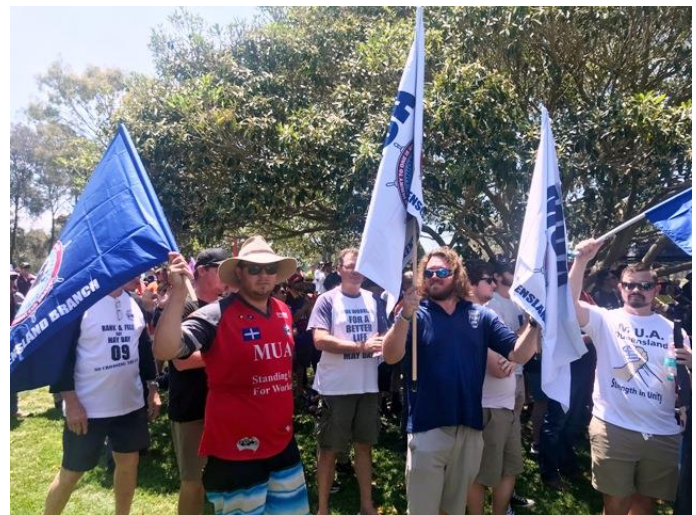
MUA Members at the Gladstone Change the Rules Rally