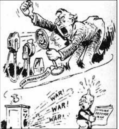
A view held by many Americans in November 1941

broadcast, "you do not wait until he has struck you before you crush him."