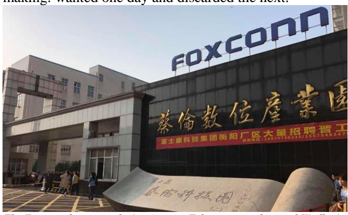
The Foxconn factory producing Amazon Echo smartspeakers and Kindles in Hengyang.

These employees – known as dispatch workers in China – are hired in from labour companies as an off-the-shelf workforce. They are generally slightly better-paid than permanent members of staff, but they get no sick pay or holiday pay and can be laid off without any pay at all during quiet months when production drops off. In some ways they resemble the Amazon products they are making: wanted one day and discarded the next.