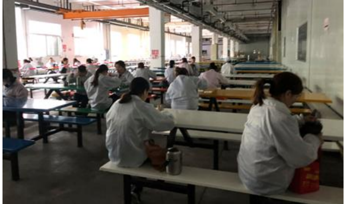
The workers' eating area in Hengyang's Foxconn factory.

Another worker tells her she, too, is suffering: "While working at the same work position and doing the same motions over and over again each day, she felt exhausted and her back was sore and her neck, back and arms could barely take it any more."