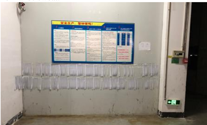
Wage slips pinned to the walls in the Foxconn factory, Hengyang.