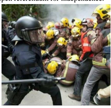
Catalunyan Firefighters defending the people in Barcelona

The IDC dockworkers refused to service the vessels that were moving 6,500 riot squad police to the region to try to supress the referendum. The simple act of not working sent a clear message to the Spanish government that the workers will not stand by and allow the suppression of their democratic right to hold a free and open referendum for independence.