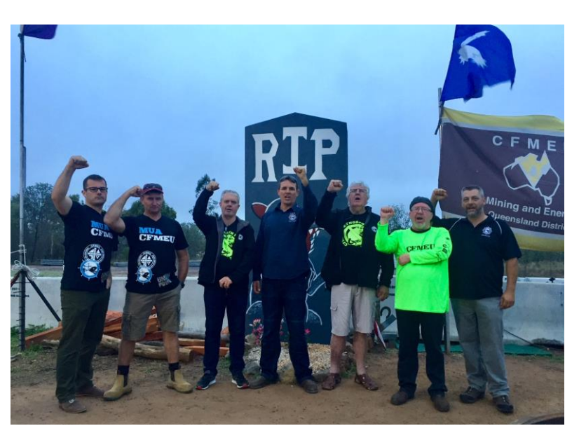
Queensland and Sydney Branch rank and file and leadership on the Oaky North picket line

The CFMEU claims this foreign company is trying to strip back hard fought for and won work conditions — which in the Australian mining industry — can impact on safety and lives.