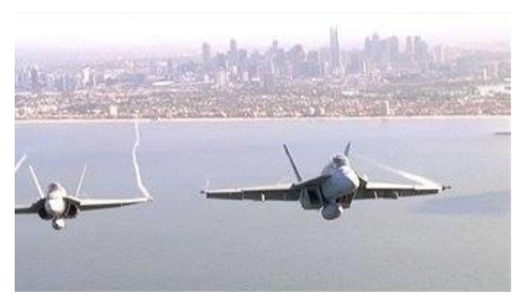
F/A-18F Super Hornets flypast Brisbane manufacturer an exporter. We have a Defence Minister like Christopher Pyne that is planning to see Australia become a major arms dealer and export these weapons of mass destruction to countries like Saudi Arabia and Israel.

Catalonian crowd and the fully armed police riot squad. Back at home we have our own aggressive right wing LNP government that have cut humanitarian aid to the lowest level in Australian history, and it is now seriously discussing the merits of becoming a major weapons