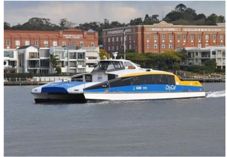
The MUA played the leading role under the slogan of "A Fair EBA for Ferry Workers". The MUA covers all workers on the Brisbane River that it is able to, under its constitution. This includes Ferry Masters.

The MUA supports all workers who fight for a better deal. It is those workers who are not in unions which should be the cause of angst amongst the union workforce.