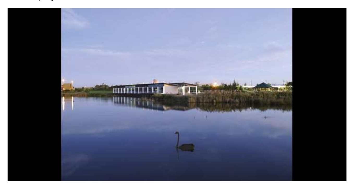
Figure 3: Photo of the former Visitors Centre and lake still available on the Visit Brisbane tourist website. The site has now been bulldozed and turned into a carpark by the privatised Port of Brisbane despite community objections.

12.6 The original Visitors Centre area was a Brisbane destination. It is still listed as such on the Visit Brisbane website, described as 'picturesque' and 'with abundant bird life', and where you could 'learn about the operations of a working port'. <sup>44</sup> The building itself won a High Commendation for Sustainable Architecture and a High Commendation for Commercial Building Architecture from the Australian Institute of Architects in 2002. <sup>45</sup>