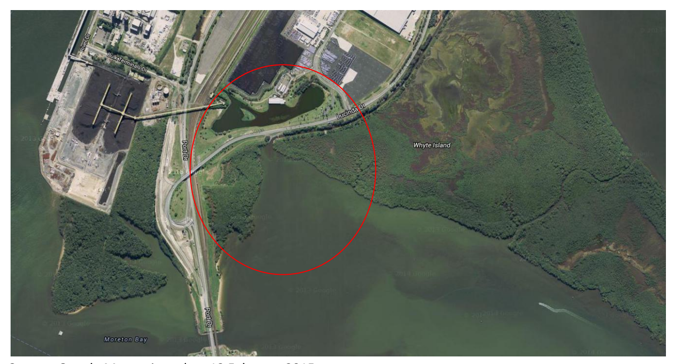
Figure 2: Community facilities which the Port of Brisbane was required to operate according to the 99-year purchase agreement of the Port, comprising the Visitors Centre and Obervation Cafe overlooking the large pond at the top of the red circle, the adjoining car park and picnic facilities, and the Shorebird Roost across the road.