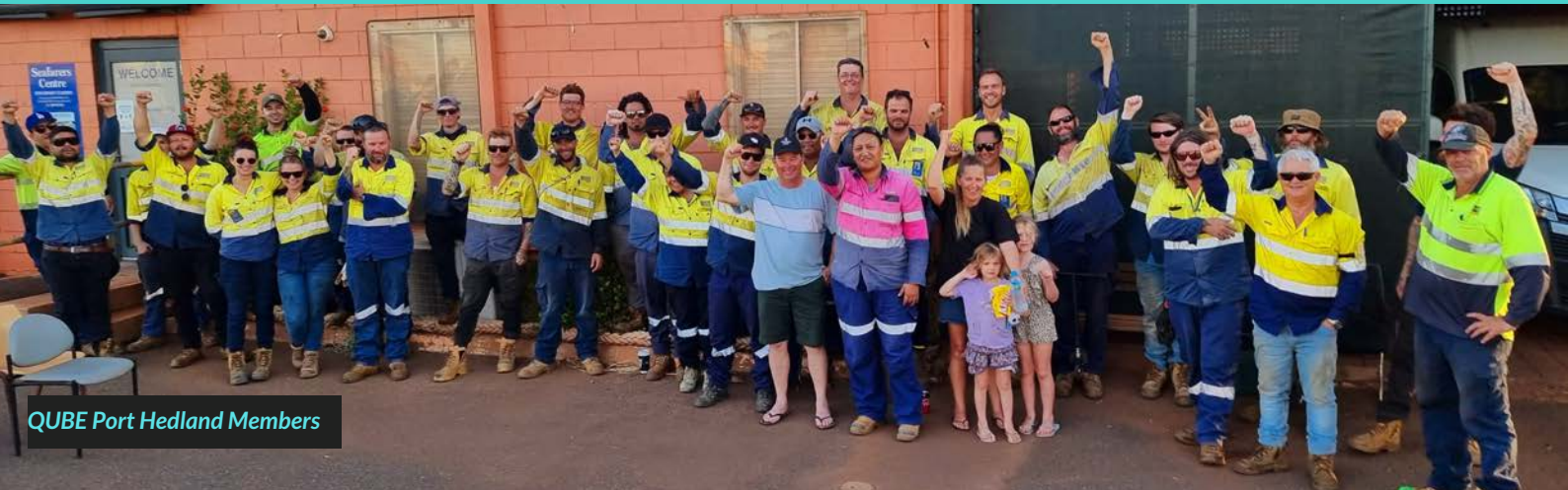
QUBE Port Hedland Members