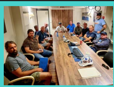
MUA Crew of the Normand Scorpion